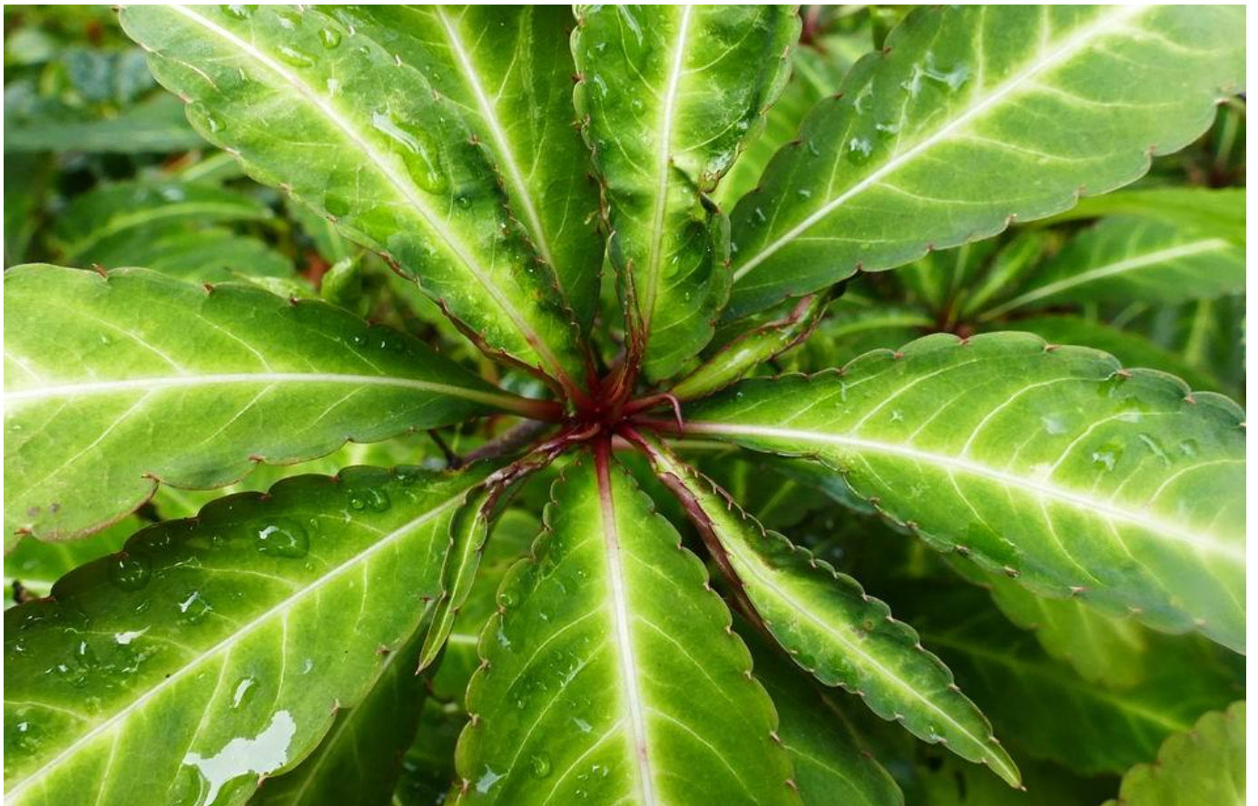
Getting in close you will find there are patterns within patterns: in fact isolating increasingly smaller areas like this is a form of looking at the abstract.