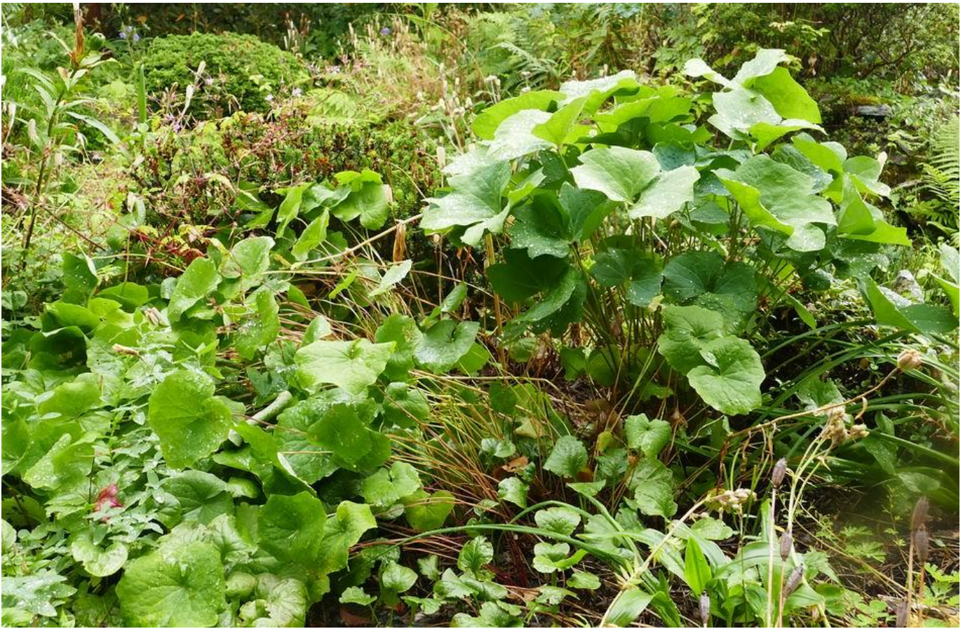
The heavy rain we had last night brings the plants some relief from the dry conditions and they respond to the moisture by sitting up again. No amount of me watering can have the same benefit as a few hours' worth of rain.