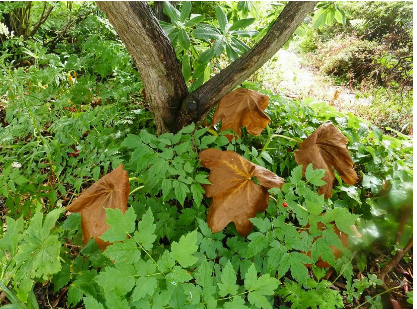
Unfortunately the rain came too late for this Podophyllum peltatum whose leaves have gone prematurely brown however the previously floppy stems have become turgid again holding the brown leaves up above the Actaea .