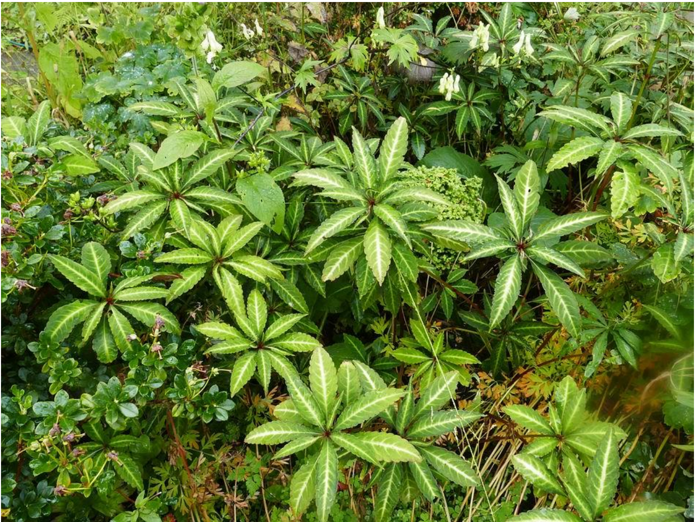
The artist in me is always looking at patterns, shapes and colours such as the striking leaves of Impatiens omeiana that before the rain were stilling limp but are now held up proudly having been revived by the rain