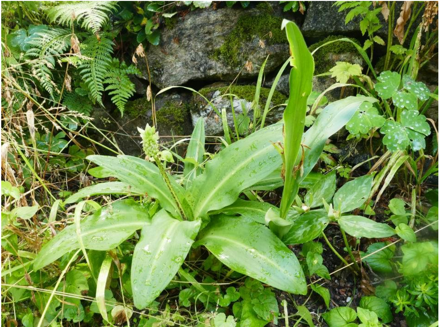
South Africa, Asia and North America are represented in this small grouping of plants: Eucomis tricolor , Roscoeae humeana and Trillium luteum .