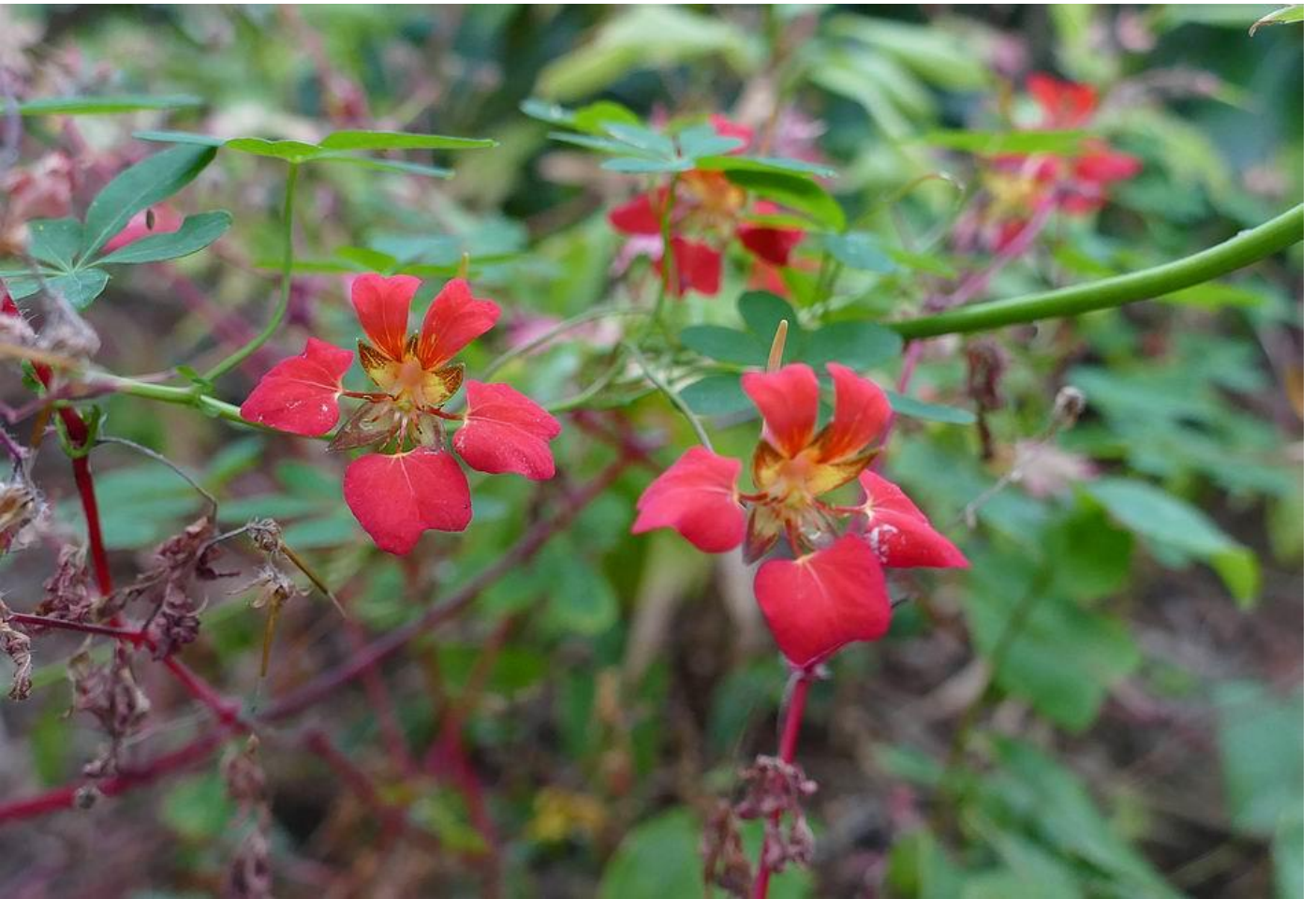
Two more flowers that did not make the cover are on this page, first the bright red Tropaeolum speciosum .