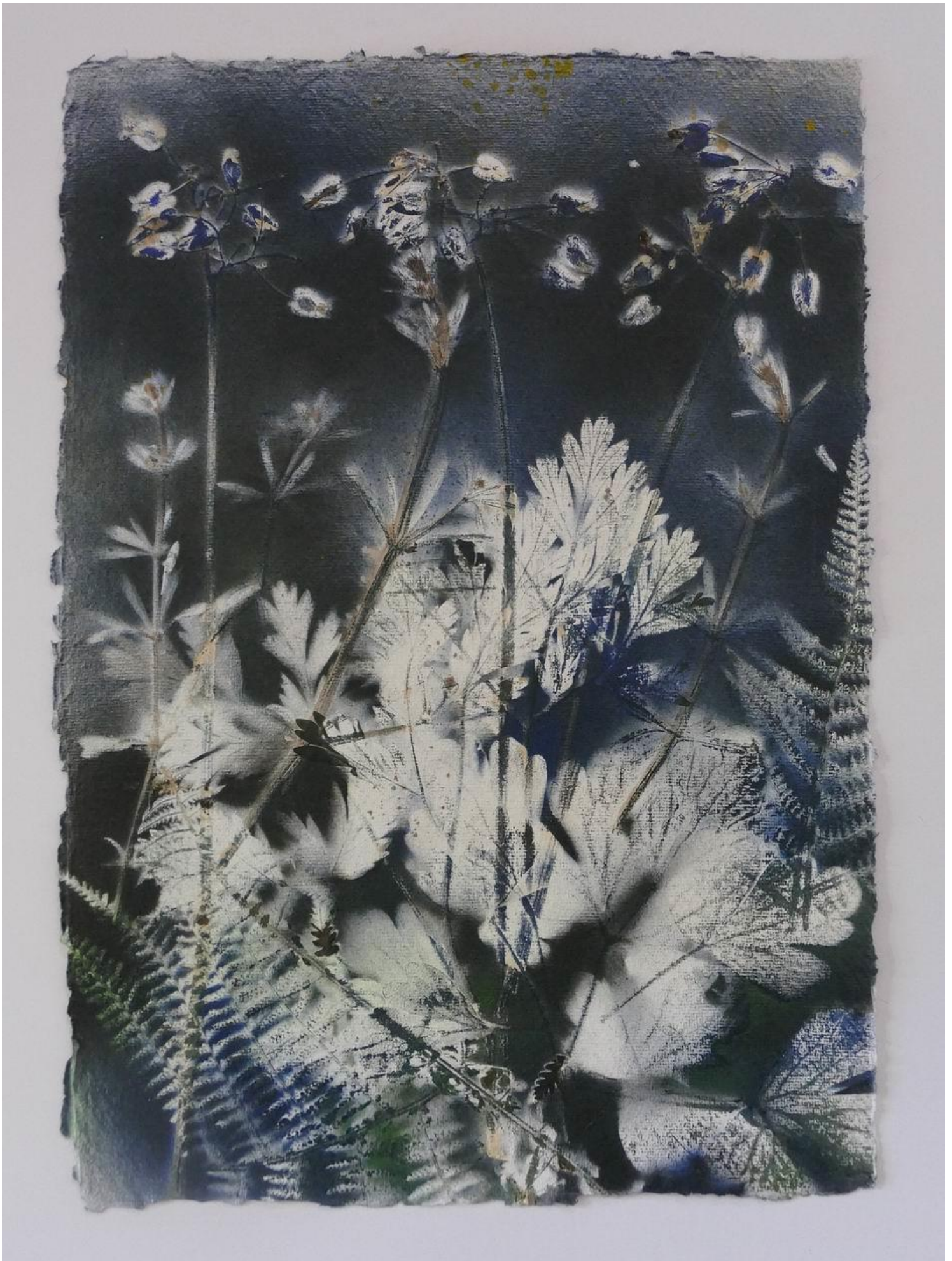
In this mixed media drawing on hand made paper I try make your eyes dart around focusing in on different areas or details. In just the same way as they do when you are in front of the actual scene or in the previous photograph you can never focus in on the whole work at the same time.