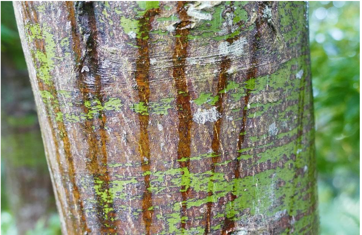
The bark pattern on one of our Acer trees is temporally enhanced while it is raining by the drips of water running down creating darker lines.