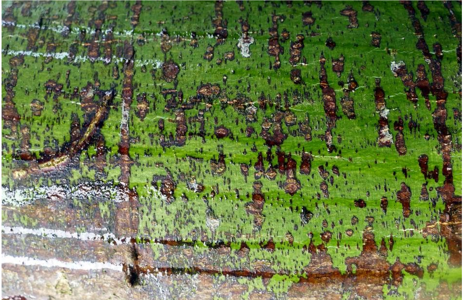
Changing the orientation of the image can increase the abstraction.