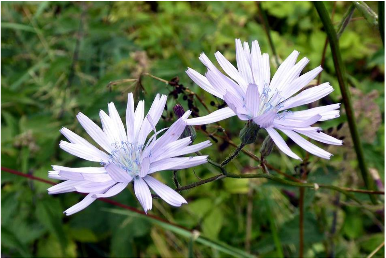
Cicerbita macrophylla has thistle like down attached to the seeds which fly away to be dispersed by the wind.