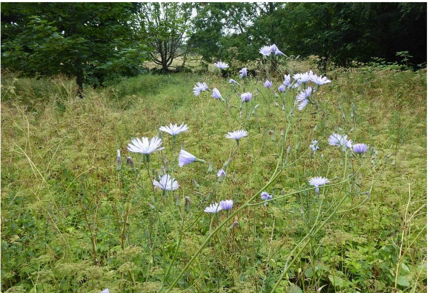
On my walk I find Cicerbita macrophylla known as the Blue Sow Thistle not to be confused with the similar looking Cichorium intybus (Chicory) which holds its bluer flowers closer to the stem.