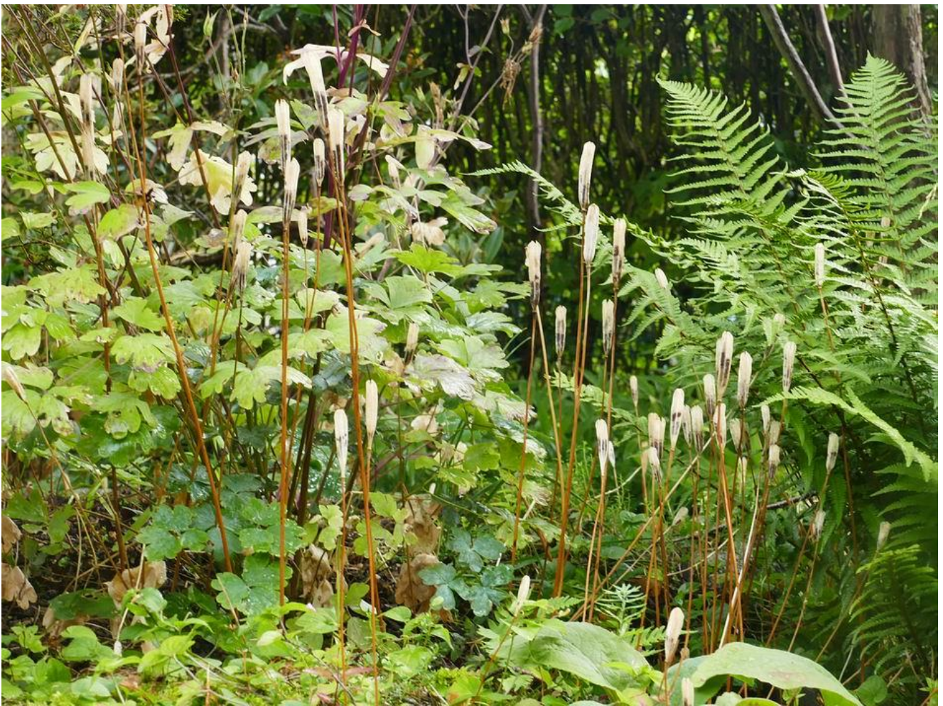
Seen against the light I can see that a few of the Erythronium seedpods are still holding on to some seed.